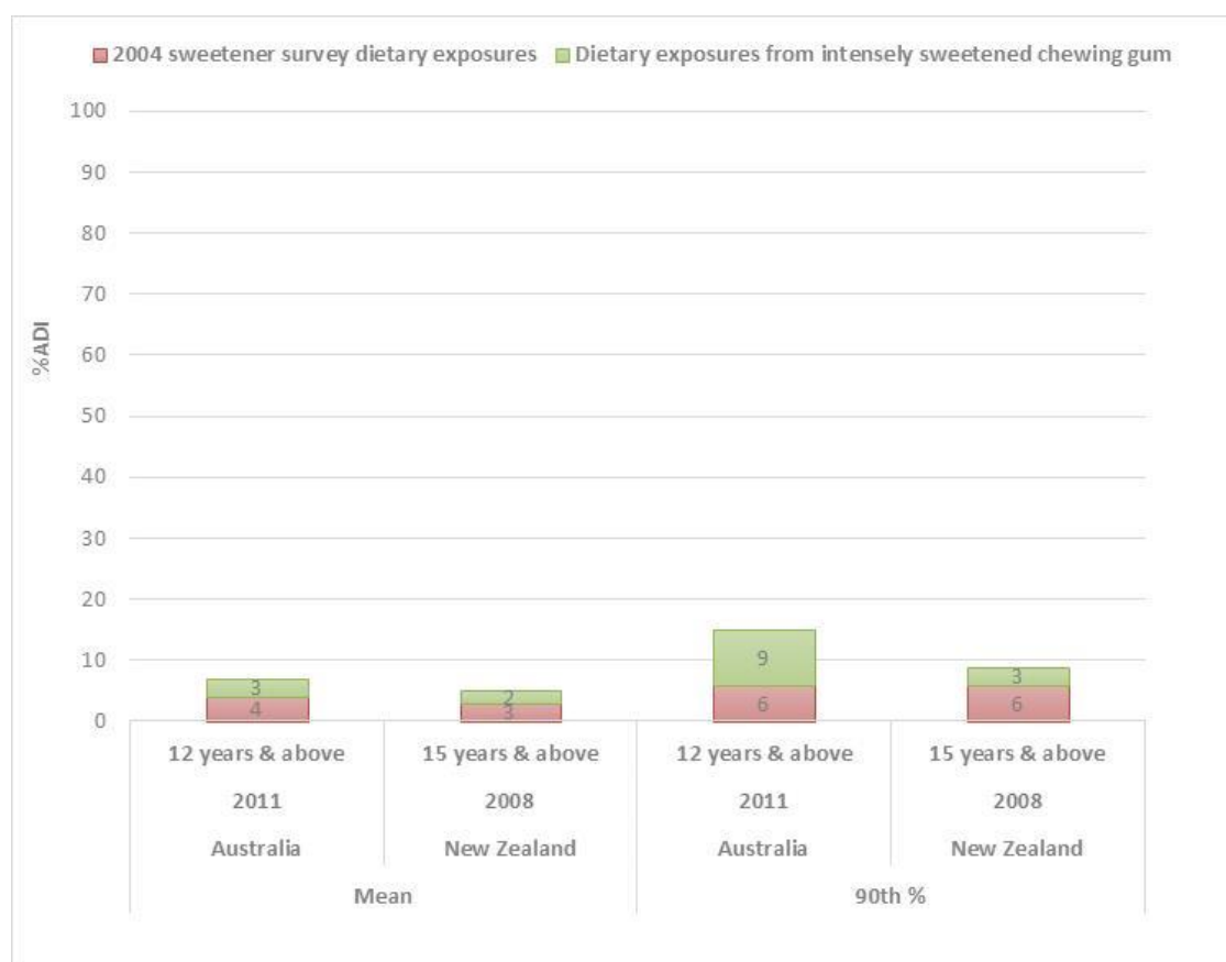
Figure 4.2: Estimated mean and 90 th percentile population dietary exposures to Ace K as a percentage of the ADI for all population groups assessed

With this combined estimate, the mean and 90 th percentile dietary exposures for consumers were well below the ADI for the 12 years and over population group for Australia and 15 years and over group for New Zealand when the increased MPL Scenario was considered. Combined estimated mean dietary exposures for Ace K were 5-7% ADI and the 90 th percentile dietary exposures were 9–15% of the ADI for the population groups assessed. See Figure 4.2 and Table A2.4 in Appendix 2 for Australia and New Zealand).