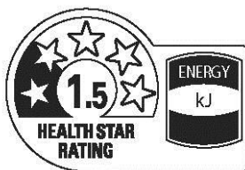
Diagram 2 Trademark example of a single energy icon with the star rating